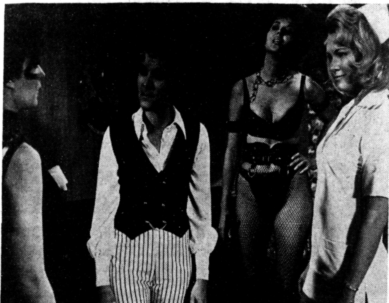
A titillating scene from "All the Loving Couples"