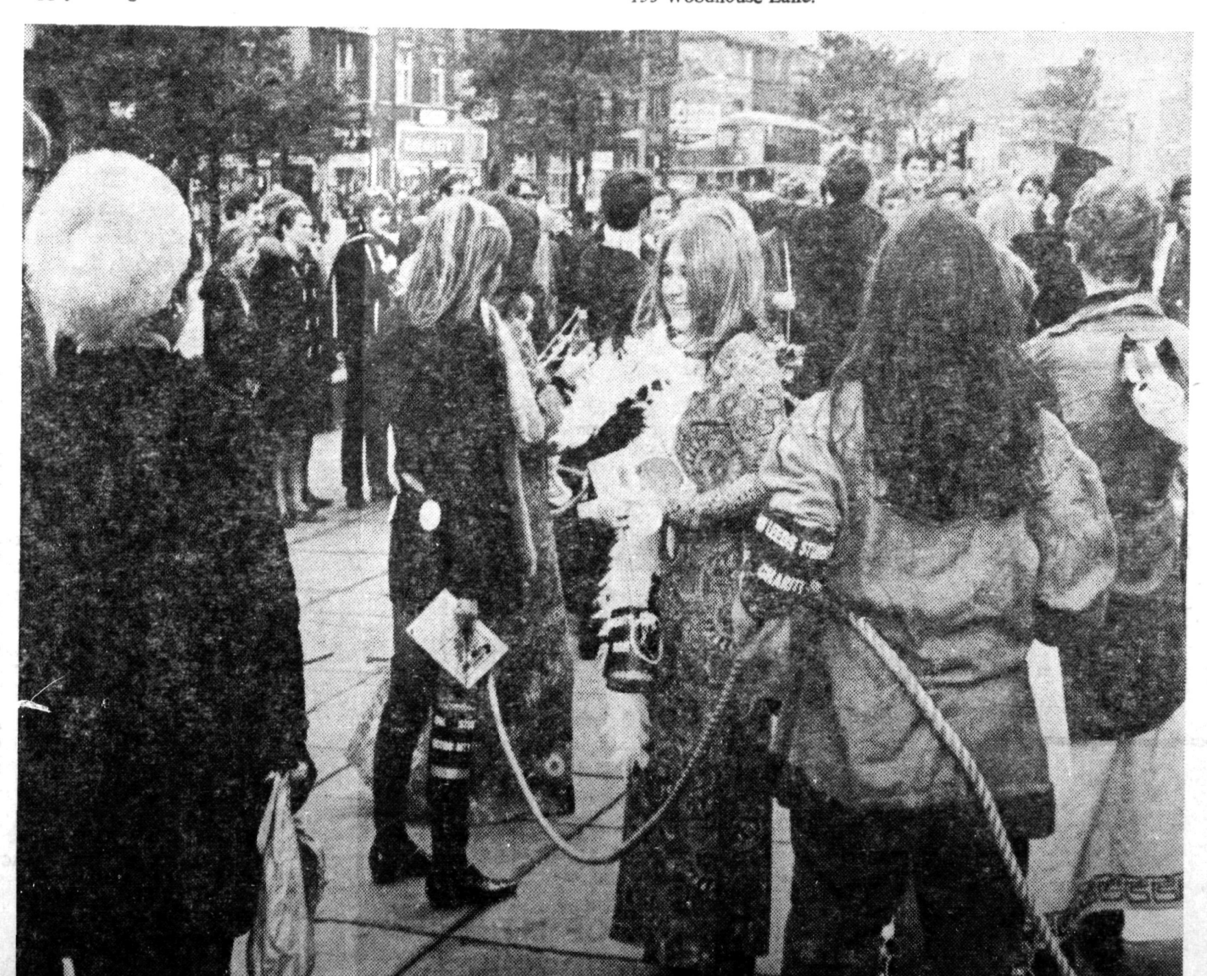
Can you be "roped in" to selling Tykes?

You can help if you want to. You know where Ragofis is: 153 Woodhouse Lane.