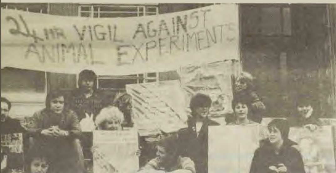
Members of LUU Animal Aid Society embarked on their 24-hour vigil against animal experiments on Wednesday.