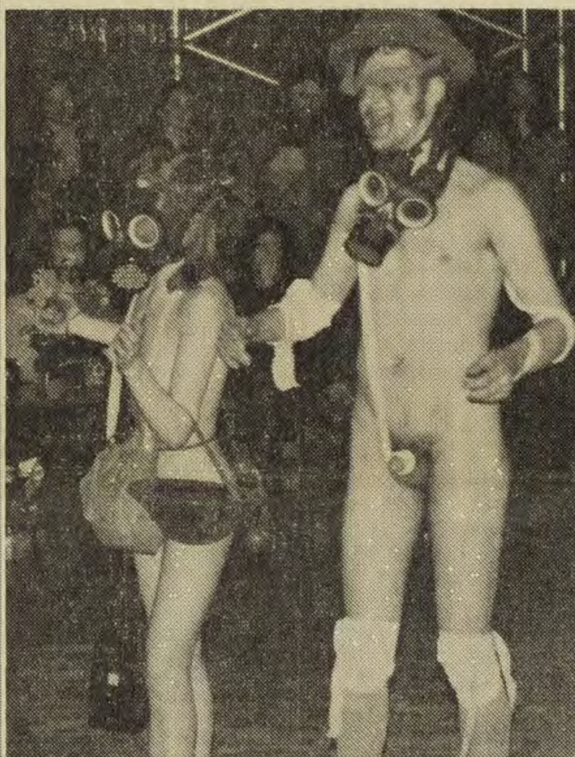
Our cameraman met this couple performing with John Bull's Puncture Repair Outfit at the University during last week's Arts Festival