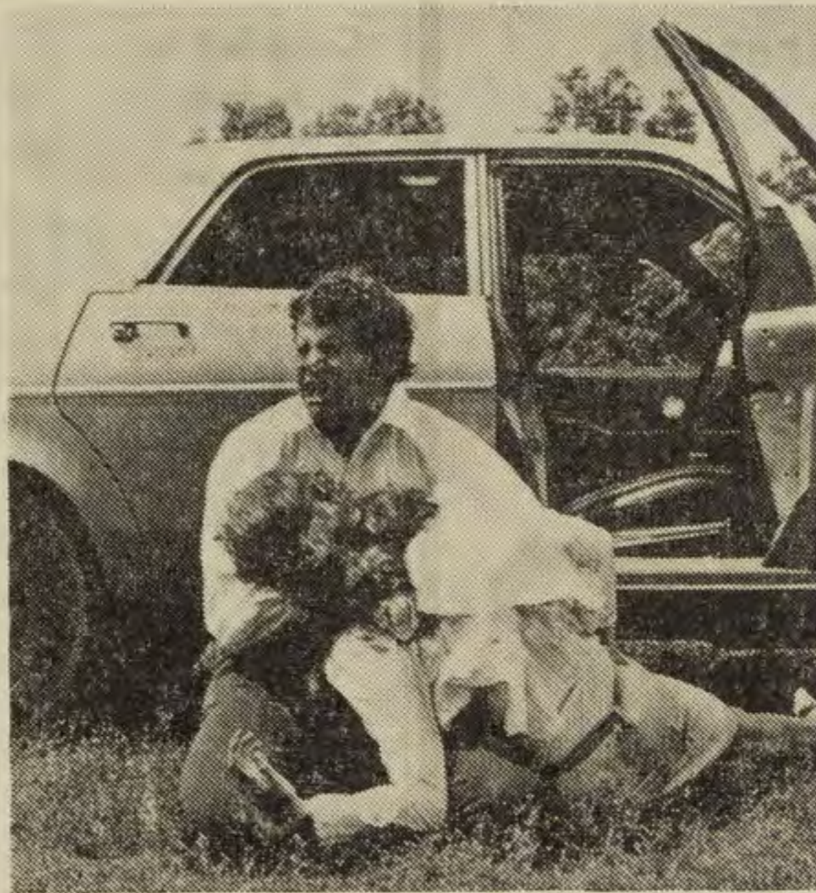
An horrific moment for the Sheriff as he cradles the bloodstained body of his wife in a scene from Walking Tall

The lyrics still have the sexist line taken by the band, (how does Faye Dunaway put up with it?), but the album doesn't hold the attention the way it should. It's still a good album, but not a world-beater.