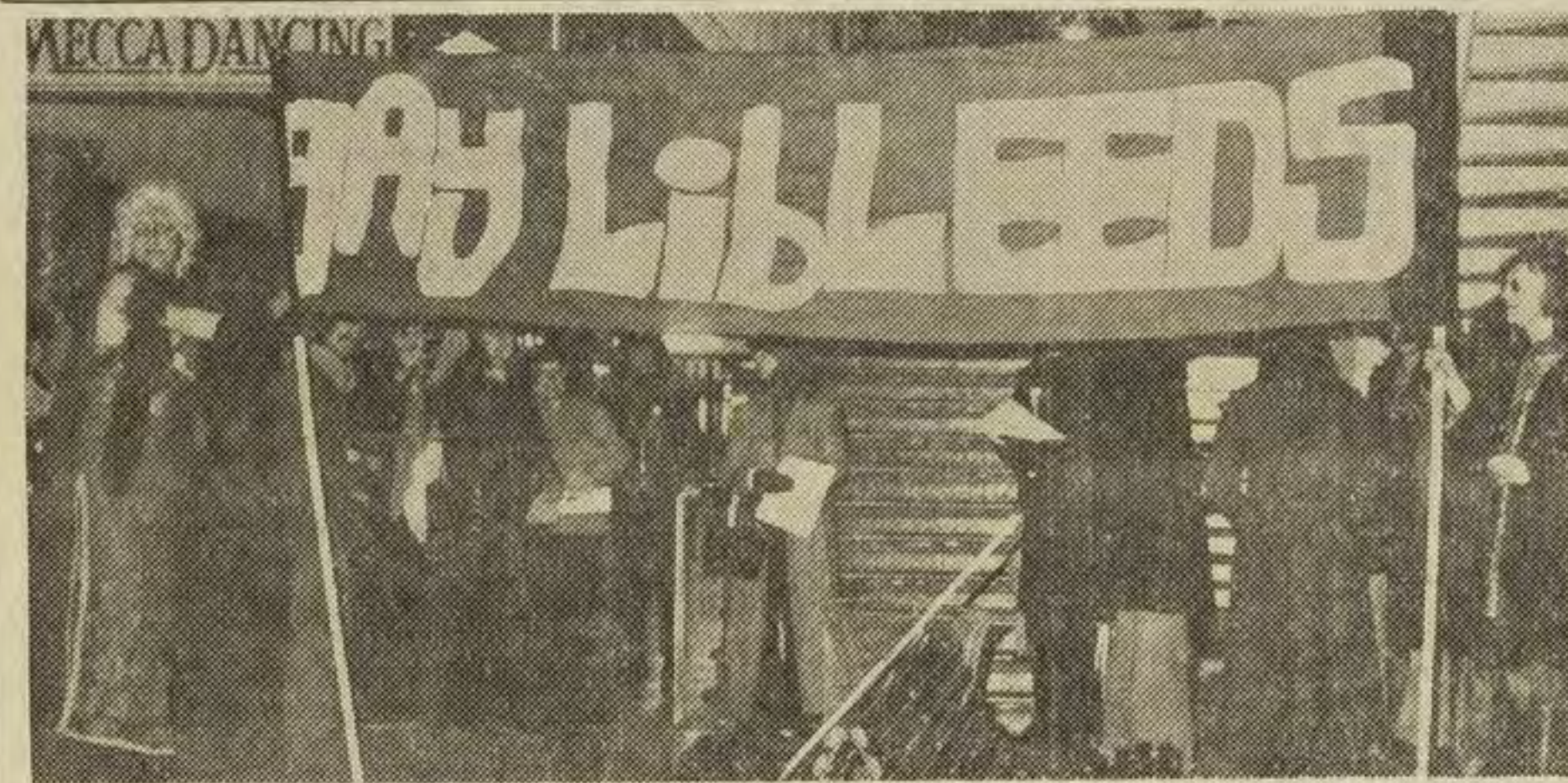
Above: Gay Lib demonstrators picketing the Miss England contest

However, there will be eight floats and Rag hope to put on an impressive display with students on foot and in cars. The procession will leave Wodhouse Moor at 2.00 pm to parade through the centre of Leeds.