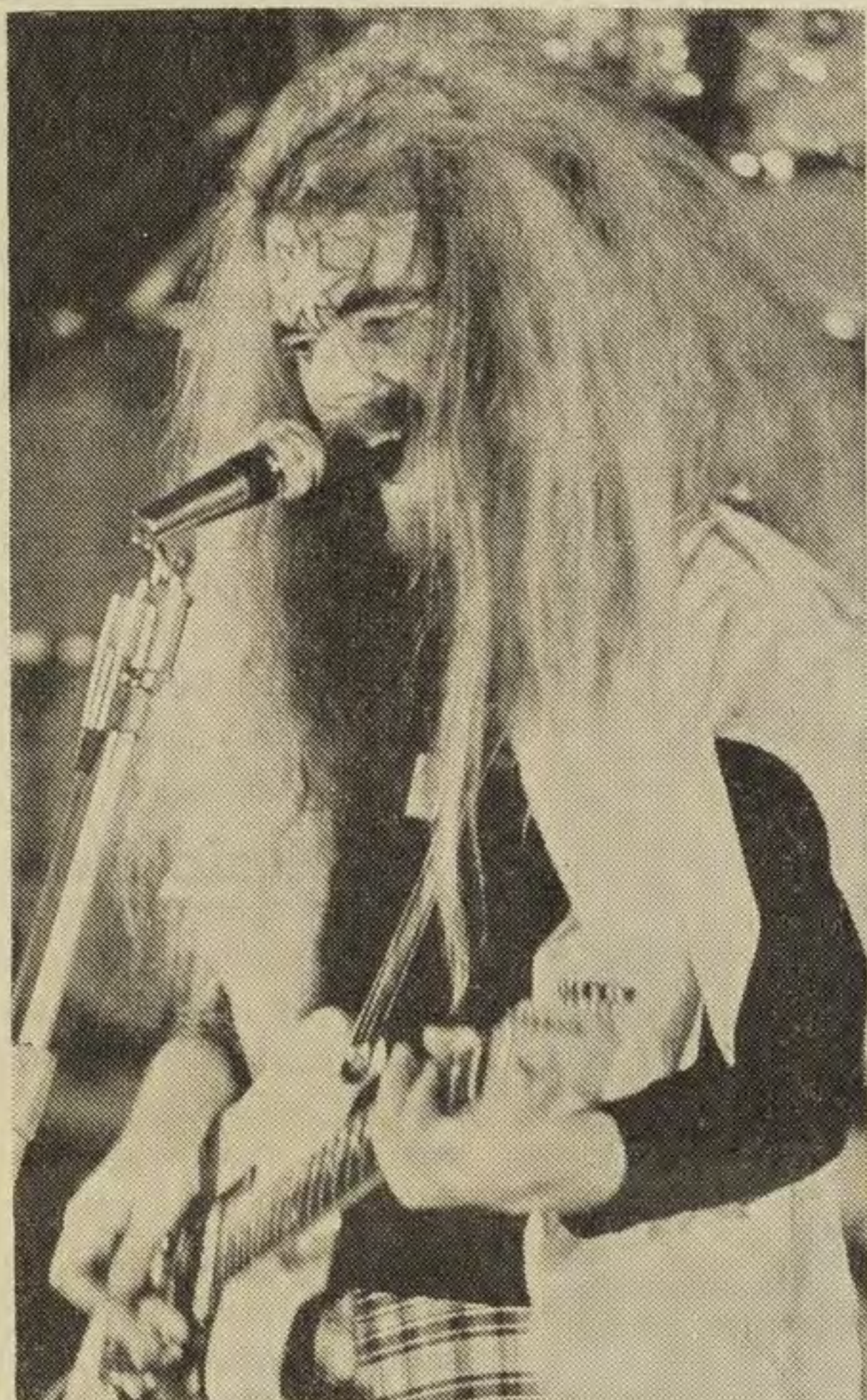
Roy Wood who appeared with Wizzard in the Rag Concert at the University last Saturday

The decision to withdraw support for the school was taken at Monday's OGM by 33 votes to 30.