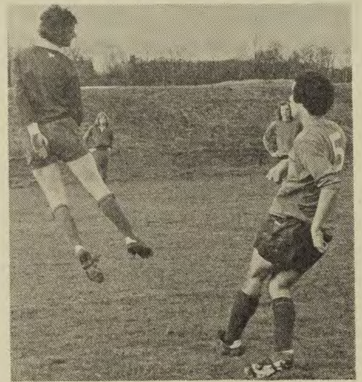
Leeds win possession in a midfield tussle against Durham

game. In the closing seconds, Durham tried hard to salvage something, but for once Leeds stood firm and denied