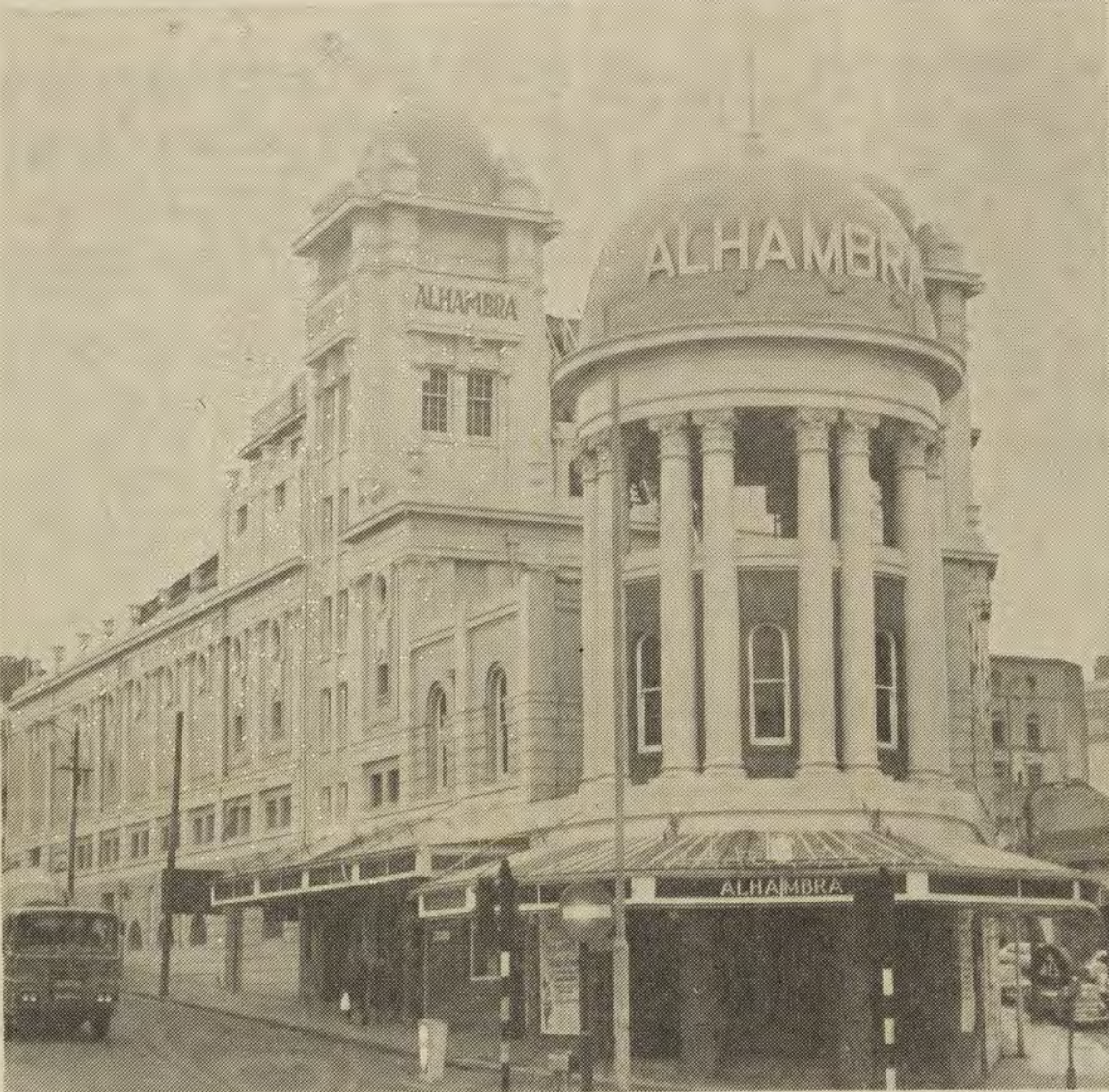
The ornate exterior of Bradford's famous Alhambra Theatre

This month Bradford's Alhambra Theatre will celebrate its Diamond Jubilee with an all star variety show which could be one of the last staged at the only remaining professional theatre in the city.