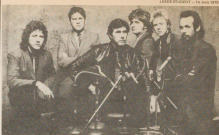
• Roxy Music

Passengers may select the calendar week in which they wish to travel. Full payment must be made with booking at least 21 days in advance. The airline will offer definite reservations between 7 and 14 days prior to departure.