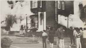
● Towering flames