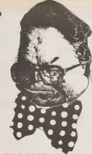
• Sir Robin Day.