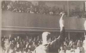
• The most packed OGM of the year votes on Rag's future.