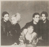
• The Human League — together conditions