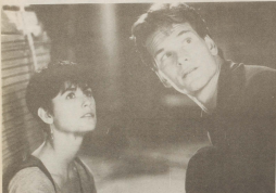
Although Patrick Swayze can't act, COBIE SMULDERS found GHOGGI , now showing at the Cannes as Le Grand Jeu .

Normally, I'd be the first to say Patrick Swayze is a mediocre actor who has made a film which has even come within spitting distance of being good. GHOGGI has turned a slight rebuke into a piece of well-crafted entertainment, a lively movie within a movie, a damn good film. Choose your own dishes.