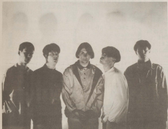
• Sunny as gold