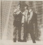
■ The Dream Warriors — combines challenge