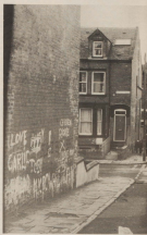
● Both land... both rent house?

"There is a continuing battle to improve standards... but that is never-ending..."