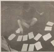
▲ An Exec member hotly collars AGM agenda on Wednesday

He referred to Disciplinary Tribunal meetings that had not been called and items that had been left off Union Council meeting agendas. Knights Network were unable to put their case for a radio station because it was left off Union Council agenda. "These are prime exam-