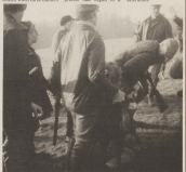
■ Hunters wrestle with a saboteur.