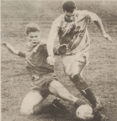
LUU 3-0s possess a 'perfect mix of muscle and skills'

The tie, set to decide who will progress to the quarter-finals, should really have been finished on the day. However, due to the failure of the officials to bring U.A.U. rule books to the site, the teams did not realize that a penalty competition should have been