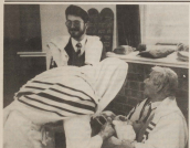
◆ The ceremonial circumlocution of the Jewish Student Chapter's sash was held at Jewish Hall, Hillier House recently. A number of students attend.