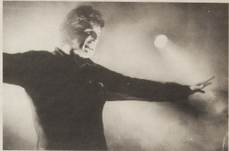
● Killing Joke - we have come for you ...

Milky through the set I realize the best something perhaps if they going on. Joe breaks a sweat of war. 'Come inside my head, I see the city of Baghdad. A baby girl is crying. Her parents are dead. Overhead the bombers...'. Some rock guitar riffs and bass riffs knock the Poly. It's a great experience but it's pure propaganda. Some of his later rants are as dangerously provocative, and he only