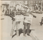
■ Would you give either of these two a lift?

Big Wash - The students' answer to children in need, the TV's Sherlock and Red Nose Day stars this Thursday, and you can rest assured that Terry Wogan won't be anywhere in sight. Lead Reg has been dogged by a lack of success in the past, and now actually closed down three years ago. I have it on good authority that the puffed mouths of Leeds students were to blame for its demise, as the "nearly offended" found events such as these tedious and the majority read out their jokes that fill 10g into a tad too thick. It's counter-its, this year's Committee have gone for the softy-salty approach, producing a squally show. Mary Whitehouse's great 10g now in which you are challenged to find anything in the least offensive. Their success seems assured. Funds raised so far amount to £18,000, and the organisers optimistically hope to have raised £25,000 by the end of the year. 75% of this money goes to local charities, whilst national organisations such as Relief , Cancer Research and Coastguard will also benefit.