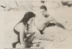
● 'He could have got fifty quid off this holiday with Lana Poff'

Hopper deserves too much time to creating