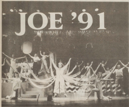
It's the Gory Gitter Gogghowl