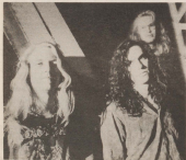
• God's Acre - No. 100 sessions