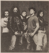
• Faith No More - several shows