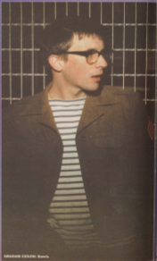
GRAHAM COXON: Bands

Coxon suggested that "It's like to be involved more for what I do. When that I hope, because it could be my stuff. I mean the guitar player in Blur and I did some good stuff in the band, but when I played was kind of an emotional barrier was. I remember, which I suppose was a bit of a break-through, the Beatles were a great for me as an individual, and maybe that was the first time as well. That's the thing about money, though, things always look better than they are, that's why I'm always looking to be the boss," he said.