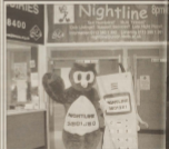
MOBILE SERVICE: The Nightline Owl and Phone raised awareness of Leeds Uni