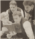
Shakespeare's Romeo and Juliet , that can't be legal

Today, cult television shows such as Queer as Folk , Queer Eye for the Straight Guy and the irrepressible Graham Norton have pushed a camp version of homosexuality to the forefront of popular culture and it is encouraging that such a cultural explosion is reflected and explored more profoundly in literature. While some writers remain tight-lipped or "in the closet" about their true sexuality, others are embraced by publishers simply because of their personal lives, possibly an effort to exploit what was once deemed shocking for the general public. Now emphasizing one's homosexuality can perhaps be interpreted as unnecessary vanity and self-promotion and can