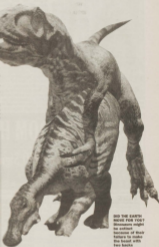
DID THE EARTH MOVE FOR FOOT Dinosaur might be extinct because of their failure to make the head with two backs

Describing the results as "surprised", he said: "I'm almost sure extinction mechanisms are an unlikely cause for the termination of the age of dinosaurs."