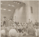
GREAT HALL: The eight honorary grads picked up their degrees in front of assembled Use big wigs and benefactors in the Great Hall

He said: "Being in the main building was like being in a hearing room with hundreds of people trying to fill complex difficult and technical and ideological ideas."