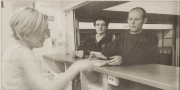
Expressing hospitality in a very practical way: St George's crypt offers food, drink and a warm atmosphere