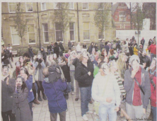
Double take: The Deputy Prime Minister could be seen around campus this week.

A video of the dancing Chaggs has been posted on YouTube with the title 'If you think that's ridiculous, you should see what the cabinet's doing to higher education.' Urging students to take part in a further protest on the 20th November, it is felt that the government have not heard the last word from this very vocal University.