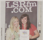
Above: LSRfm presenters and winners with their gold awards