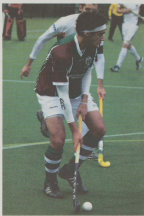
STRAYN The new season's hockey by Leeds Met.

Gryphon's centre captain put in a solid shift, trying to support his team with some work, but it didn't