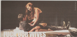
Ney Smith Hall 22nd - 23rd November, 6:42pm