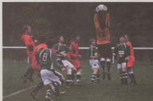
CATCH: The Sunderland keeper intercepts a Leeds long ball

Scored power and a good first touch. Making passes inside that take decisions.