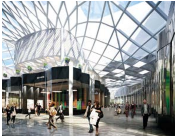
Victoria Gate, Leeds – the Consumer Data Research Centre will increase understanding of consumer behaviours