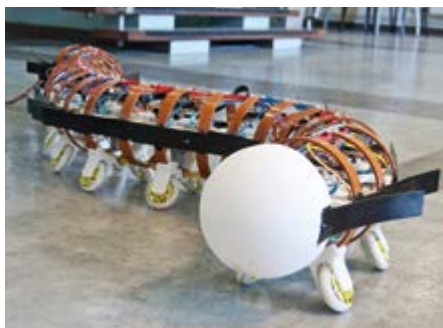
A prototype 'robo-worm' which could be used to explore inaccessible or dangerous places