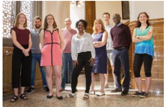
Some of the winning students and members of the team behind the Leadership Challenge

The students met academics and business leaders in Leeds, before leaving for New York where they met alumni to compare and contrast the two cities, explore the leadership challenges faced by businesses and communities, and develop their own leadership skills.