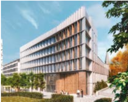
Artist's impression of the Nexus building