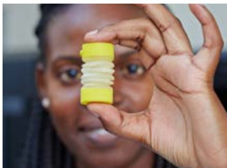
A pneumatic bellow for use in powering robotic devices fabricated through 3D printing of soft and hard materials simultaneously