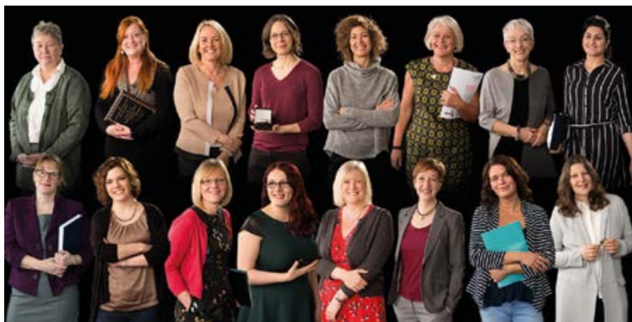
Winners of the University's fourth Women of Achievement awards