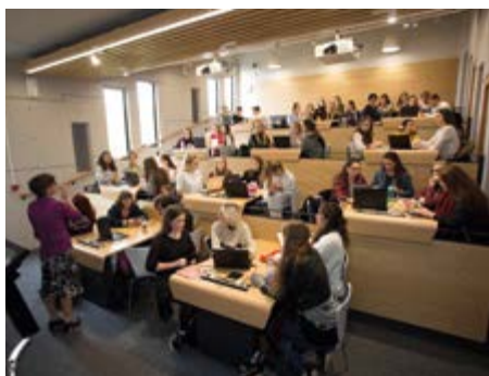
New lecture theatres allow group discussion alongside the use of installed technology to allow group work, interaction, communication and recording