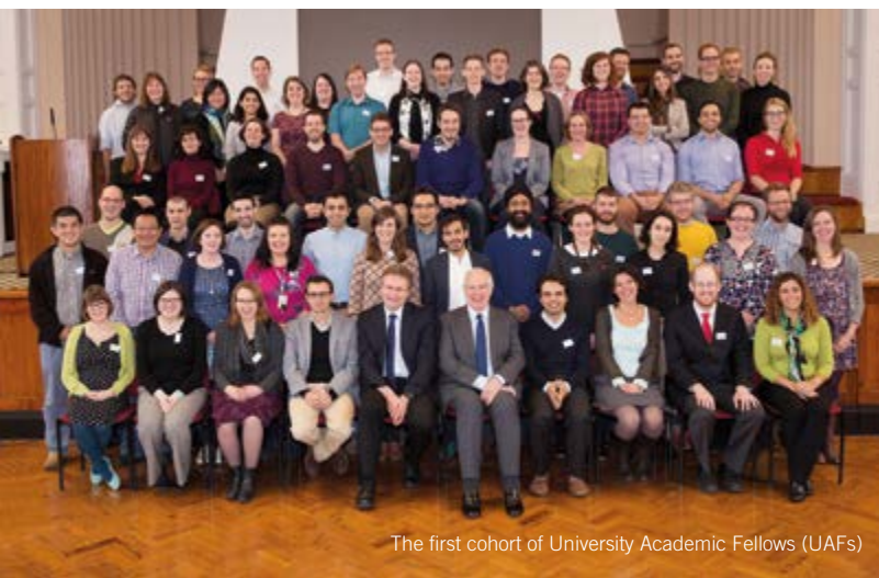
The first cohort of University Academic Fellows (UAFs)