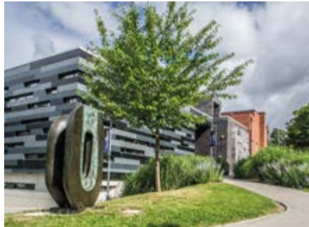
Barbara Hepworth's Dual Form sculpture

Nearby is Dual Form by the great British sculptor Barbara Hepworth, on loan for five years from the Leeds Art Gallery.