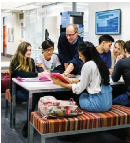
The Institute offers a hub for educational innovators and research