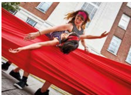
TurveyWorld Dance perform Man-Made Fibres: A Dance Response, for the Yorkshire Year of the Textile