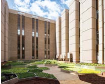
Worsley Building Roof Garden