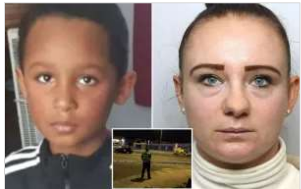
LEFT TO DIE Boy, 7, killed by taxi after mum left him home alone overnight to visit lover