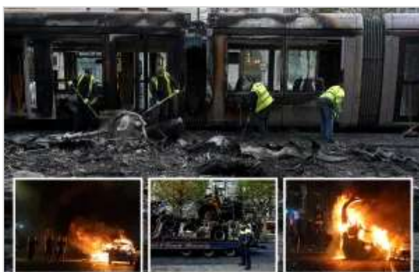
'NIGHT OF SHAME' Irish PM slams yobs after cars set on FIRE & cops battered in riots