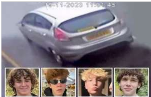
FINAL MOMENTS Chilling CCTV shows tragic teens in minutes before horror crash